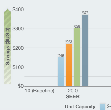
Annual Energy Cost Savings for Cooling 10-SEER Baseline*